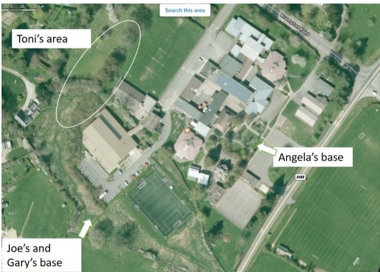
Illustration 1: Areas of the Community College / SpArC grounds used for the different activities.

A group of 25 children was assigned by the college to the Experiencing Biodiversity theme for the day. Those children were then divided into 3 groups of around 8 children for each activity. The 3 groups then rotated through all of the activities for the day, with the group on activity 3 further split between the 2 activities. Whilst we reached a smaller group than anticipated, the children were able to do all 3 activities and were able to spend longer on each activity.