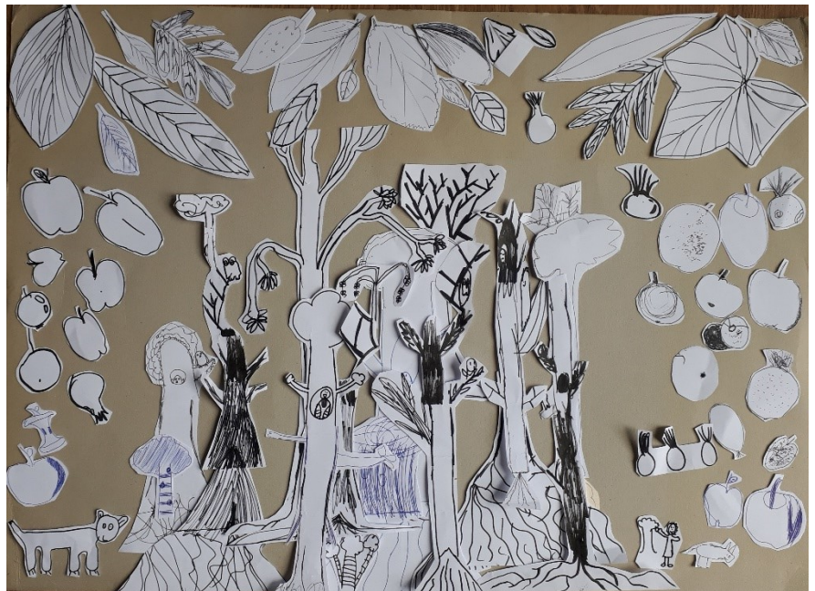
Illustration 2: Pupils attending Tree, See, Draw, Explore Enrichment Sessions with Angela Martin and their drawings